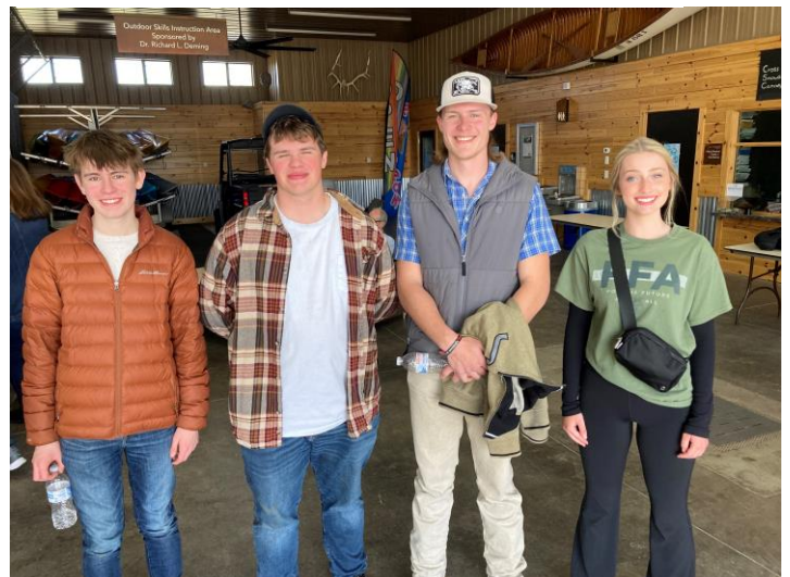
FFA 1 st Place and 2 nd Place overall: Muscatine Gold FFA; $1,000 cash prize for 2 nd place.