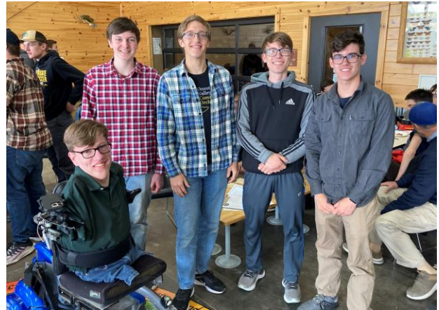
1 st Place overall: Decorah Nerd Republic; win all-expenses paid trip to international competition in Vancouver!