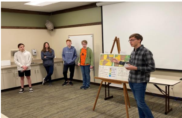
3 rd Place overall: Menacing Monarchs Marshalltown; $500 cash prize for 3 rd place (4 th place winners – Skabush Decorah, earn $250 cash prize).