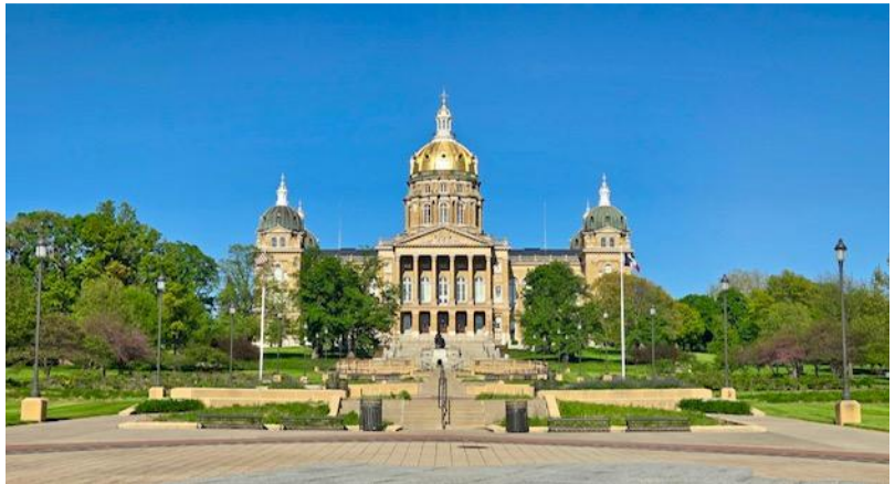
The west side of the Iowa State Capitol the morning of the final day of the 2025 Legislative Session.